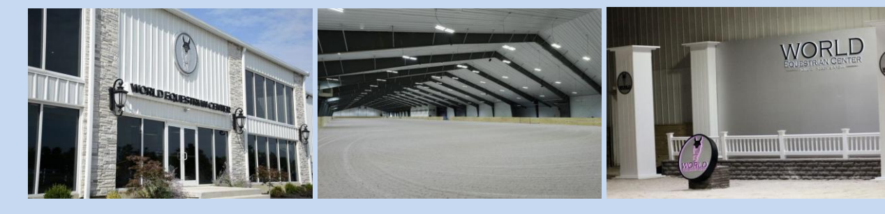
The Paddock Club ~ The Sanctuary ~ Barns ~ Cabins ~ International Grille & Café ~ Aveda Salon & Day Spa